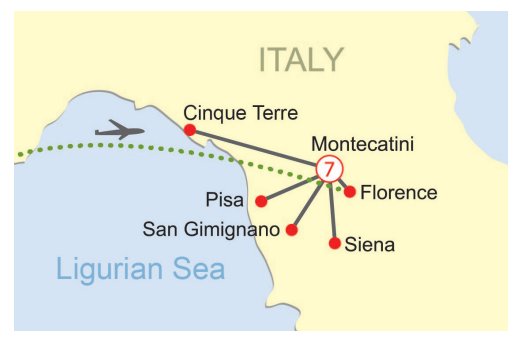
· · · · · Flight Motorcoach