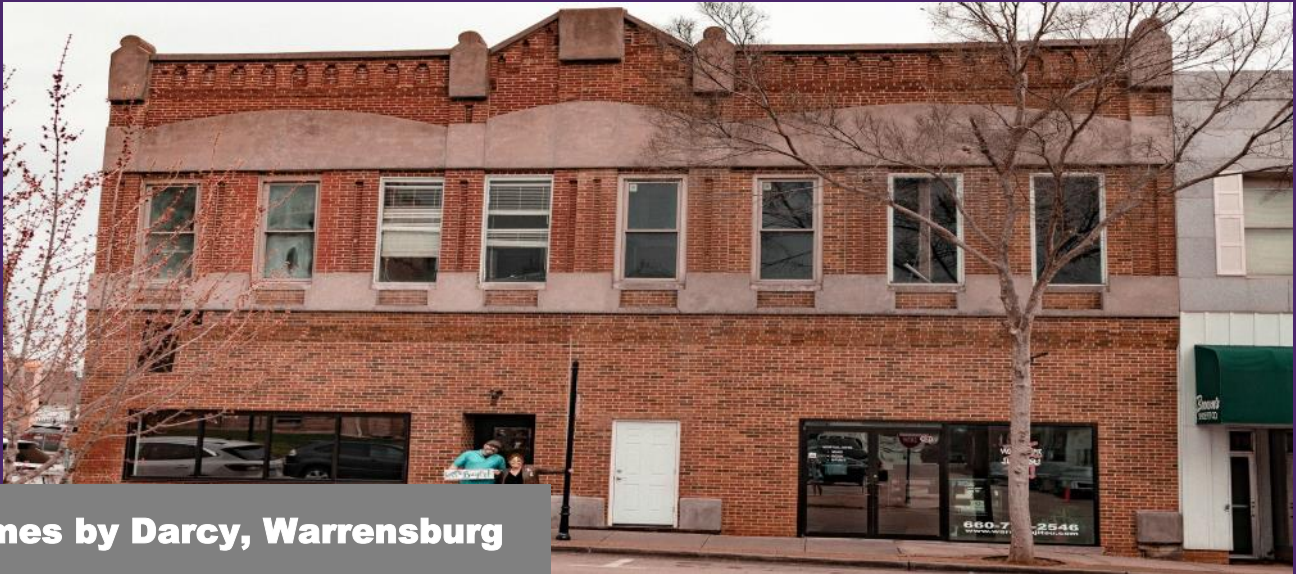
Homes by Darcy, Warrensburg

Homes by Darcy, LLC is a Real Estate Group committed to their clients and the support of the community. Homes by Darcy is regularly seen giving back to Big Brothers Big Sisters, teachers, and Survival House, with fundraisers nearly monthly. We are glad to have them in our community!