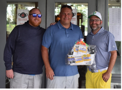
Congratulations to all the Winning Teams!