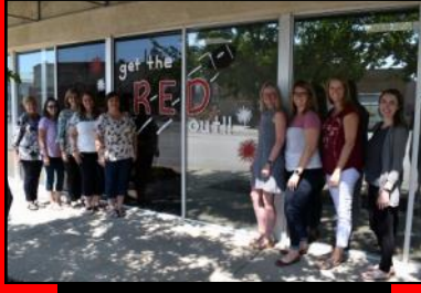
Mike Keith Insurance