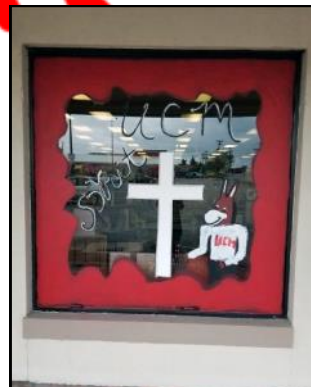
Bread of Life Books & Gifts