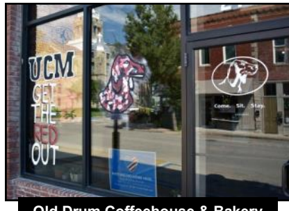
Old Drum Coffeehouse & Bakery