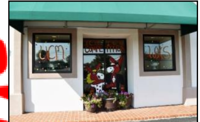
Glasscock Jewelry Corner