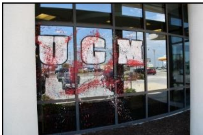
Central Missouri Community Credit Union