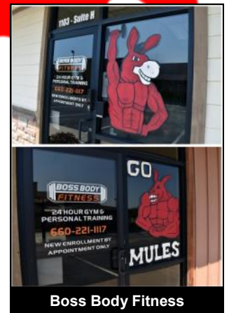
Boss Body Fitness