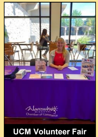
UCM Volunteer Fair