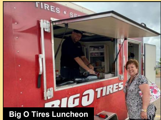
Big O Tires Luncheon