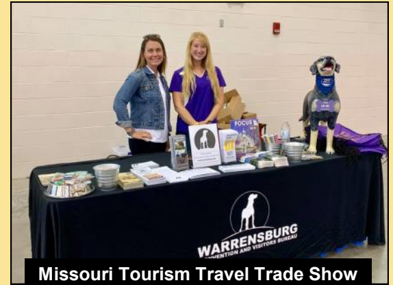
Missouri Tourism Travel Trade Show