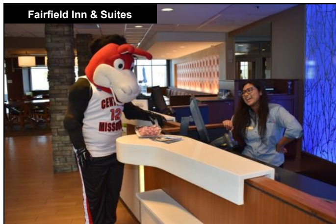
Fairfield Inn & Suites

To celebrate Paint the Town Red and Get the Red Out, Mo the Mule traveled with us to visit some of our chamber members. See everyone Mo visited on our Facebook page! @ChamberWarrensburgMO