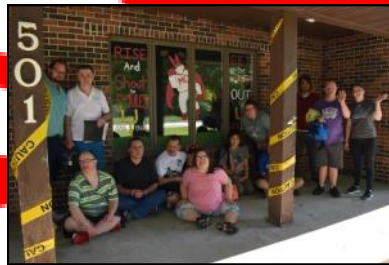
RISE Center for Growth