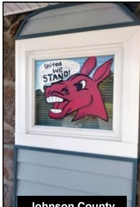
Johnson County United Way