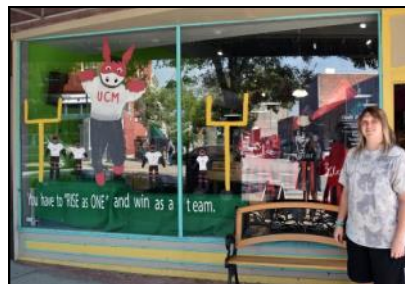
RISE Crafts & Curiosities