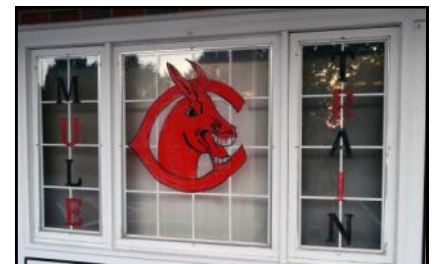
Warrensburg Manor Care Center