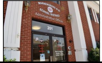
Warrensburg R-VI School District