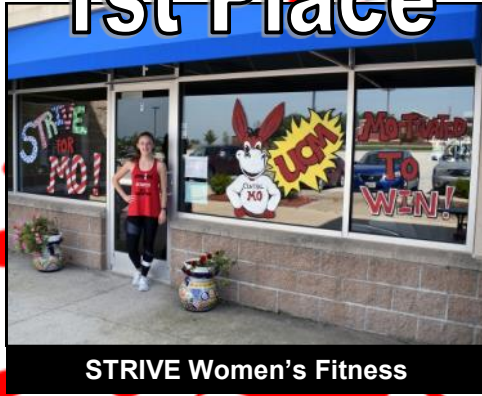
STRIVE Women's Fitness