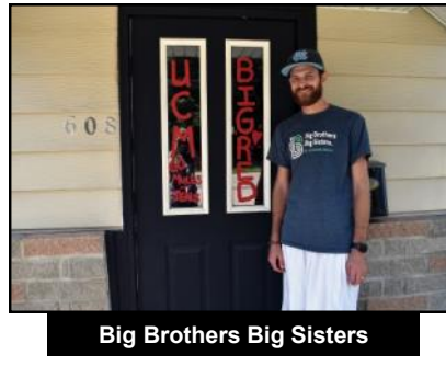
Big Brothers Big Sisters