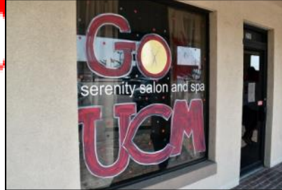
Serenity Salon & Spa