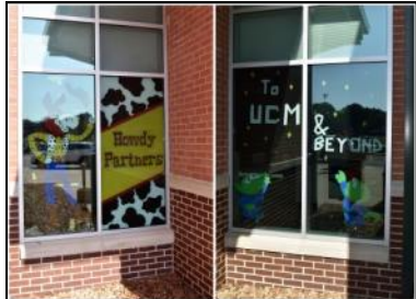
Warrensburg Parks & Rec