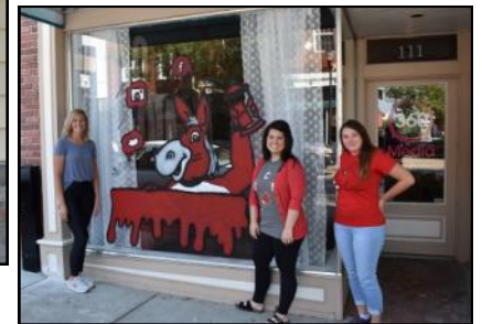
360 Media Co.