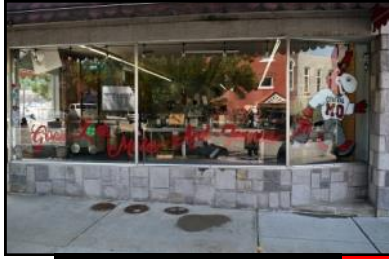
Laser Quick Printing